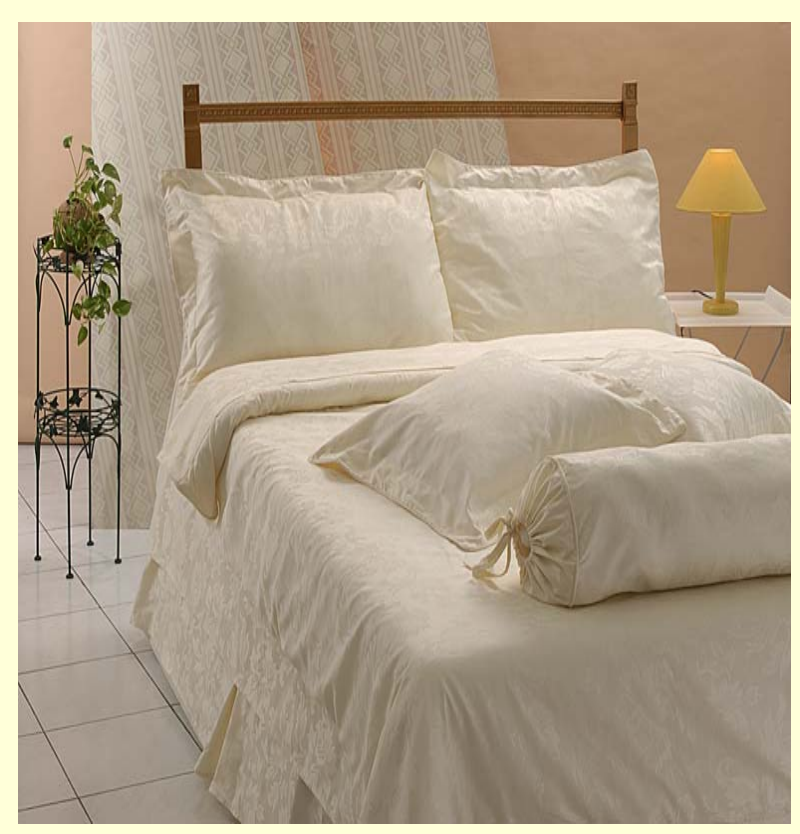
Our own brand name