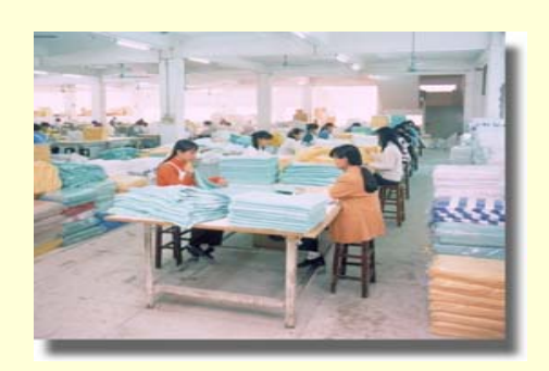
Inspection & Finishing