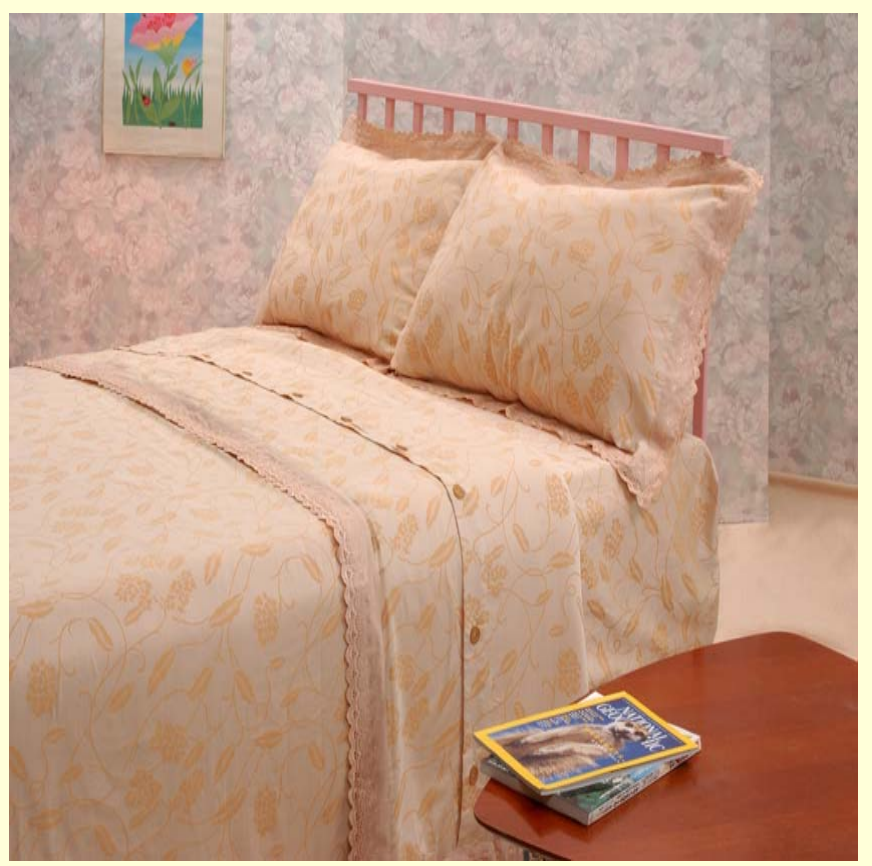
100% Cotton Jacquard